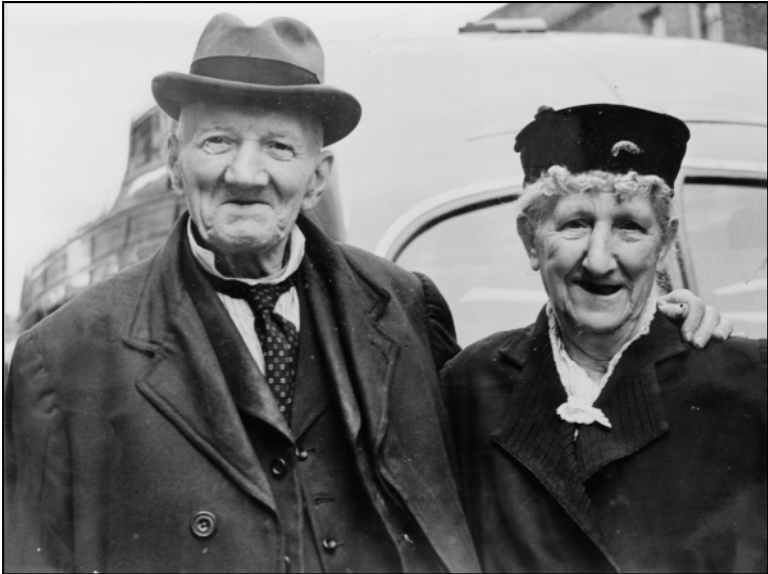
Plate 4 Two friends about to set out to Clacton-on-Sea on an outing organised by a club for older people in Bethnal Green, 1950