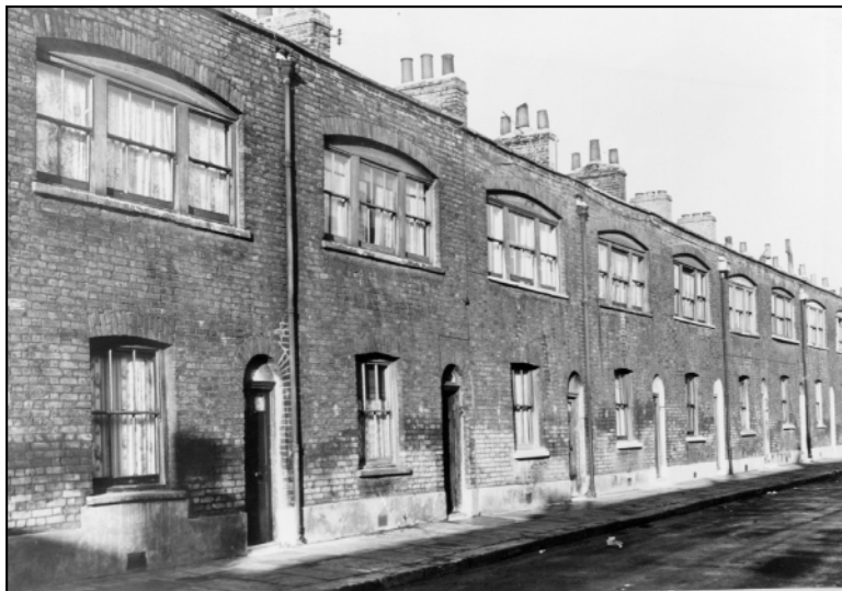
Plate 6: Weavers cottages in Bethnal Green

Note: originally built in the late 1820s and demolished around 1958 to make way for a block of flats. A man of eighty-two was recorded living in the almost deserted street, having lived in the house for some sixty-five years