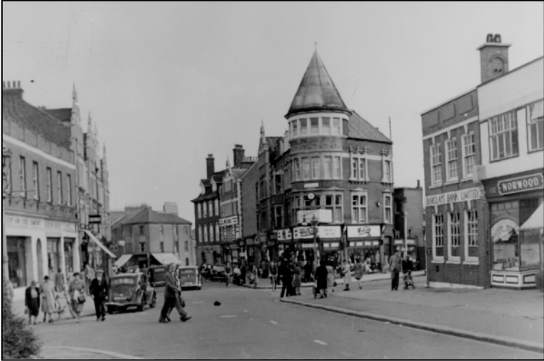
Plate 10: Shopping in South Woodford, early 1950s