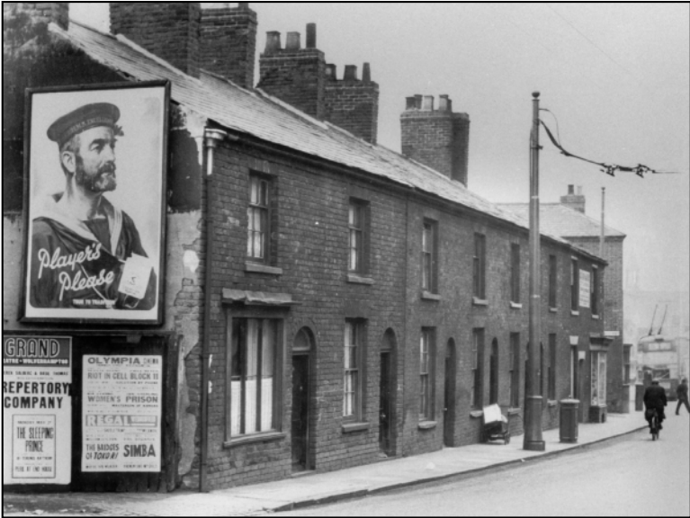
Plate 9: Heath Town, Wolverhampton, 1953

Note: This area of terraced housing was largely demolished by 1956