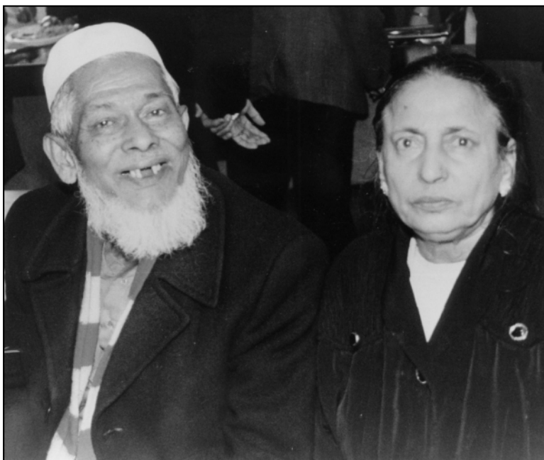
Plate 8: Bangladeshi couple, late 1990s

A third important characteristic concerns both the geographical clustering of the Bangladeshis, and the nature of their accommodation. Inner London is home to 41 per cent of all Bangladeshis, with Tower Hamlets taking the largest proportion. Regarding housing, 35 per cent of Bangladeshis are council tenants, and 37 per cent live in flats or bedsits. Bangladeshis are also more likely to live in accommodation more than three storeys high: nearly six out of ten did so according to the