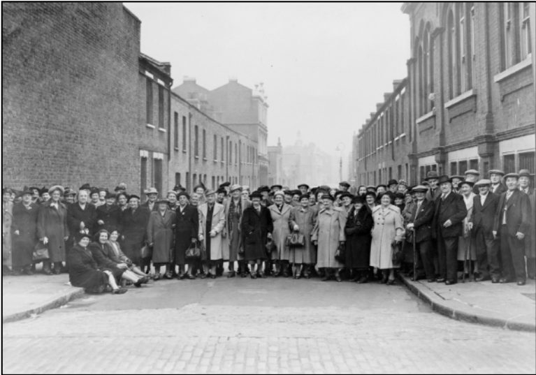
Plate 5: Group photograph of members of Friends Hall Older People's Club (Bethnal Green), taken just before an outing to Southend, 1952

It's nice and quite and no aggro. We've got good neighbours, and