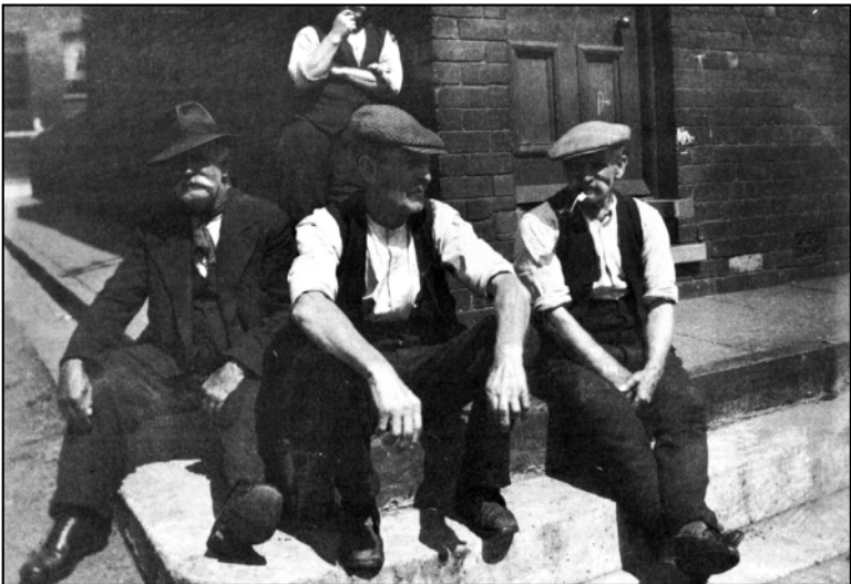
Plate 3: Group of men on a street corner in a Yorkshire mining village, early 1950s