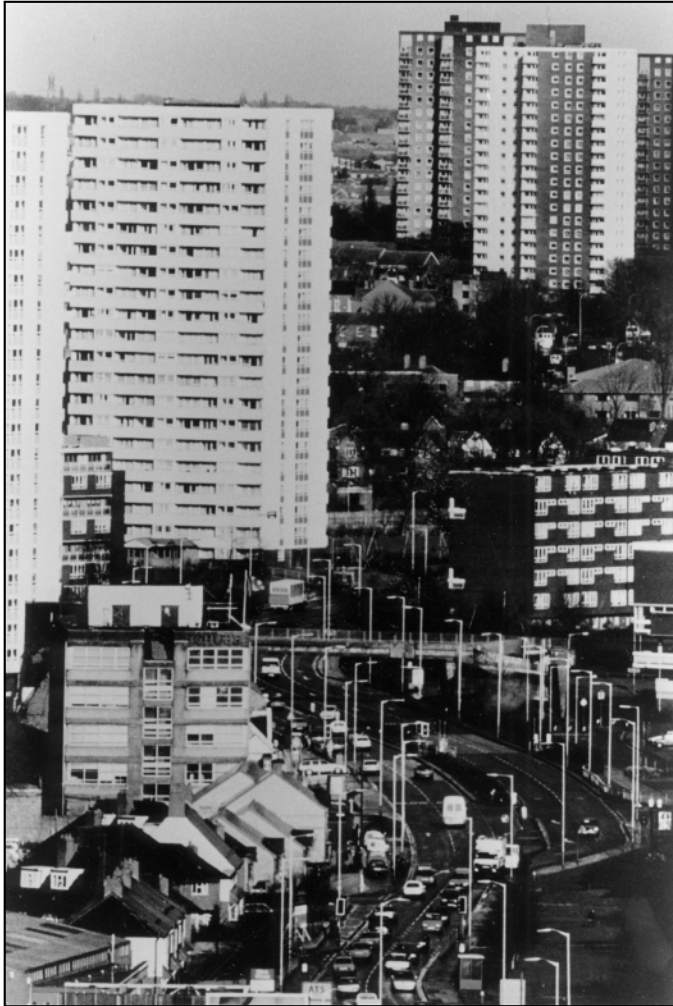
Plate 11: Heath Town, Wolverhampton, mid-1990s