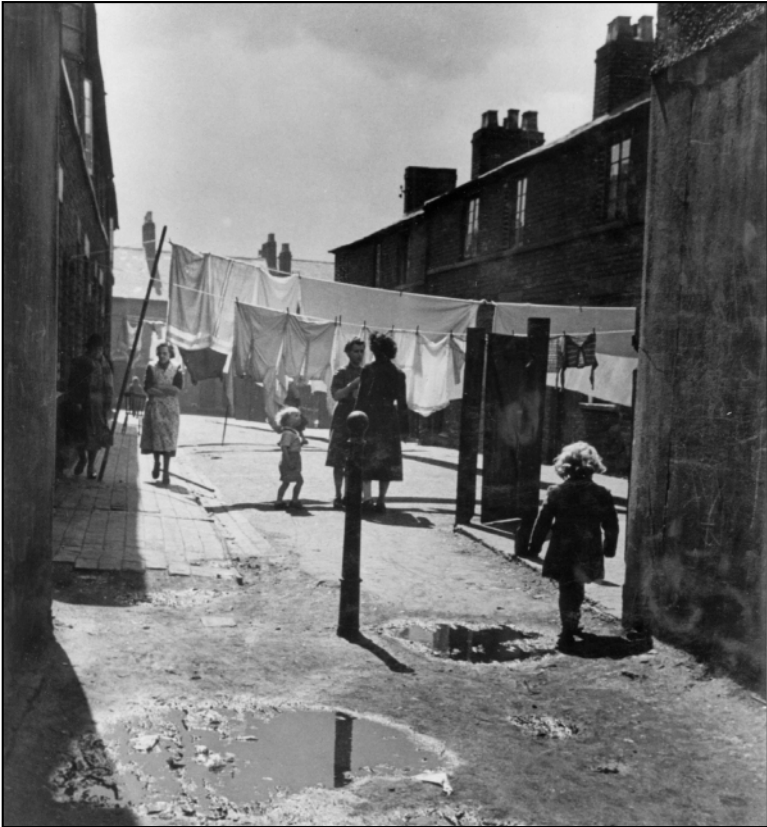
Plate 7: Washing day: King Edward's Row, Wolverhampton, 1952.

Note: This housing was demolished in the mid-1950s