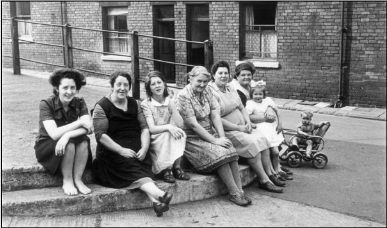
Plate 2: Intergenerational group of women pictured in a Yorkshire mining village in the early 1950s