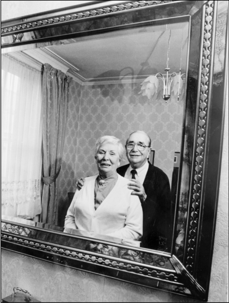
Plate 12: Pensioner couple, Bethnal Green, early 1990s