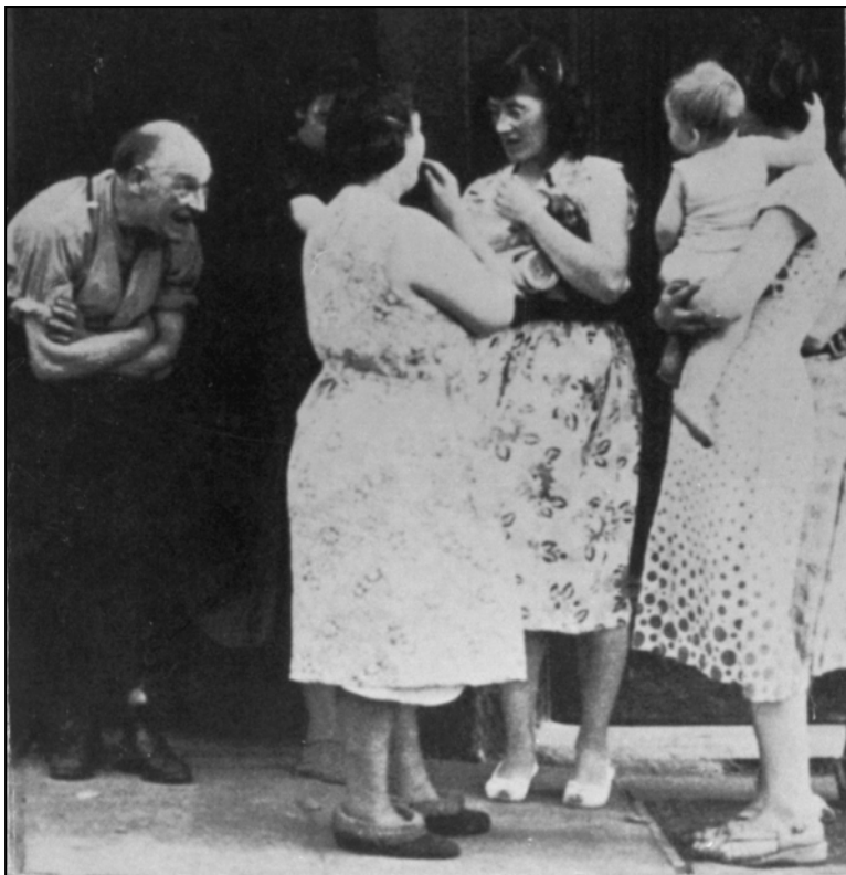
Plate 1: Street scene in London in the early 1950s

Note: This photograph was reproduced on the front cover of early paperback editions of Family and Kinship in East London , by Michael Young and Peter Wilmott